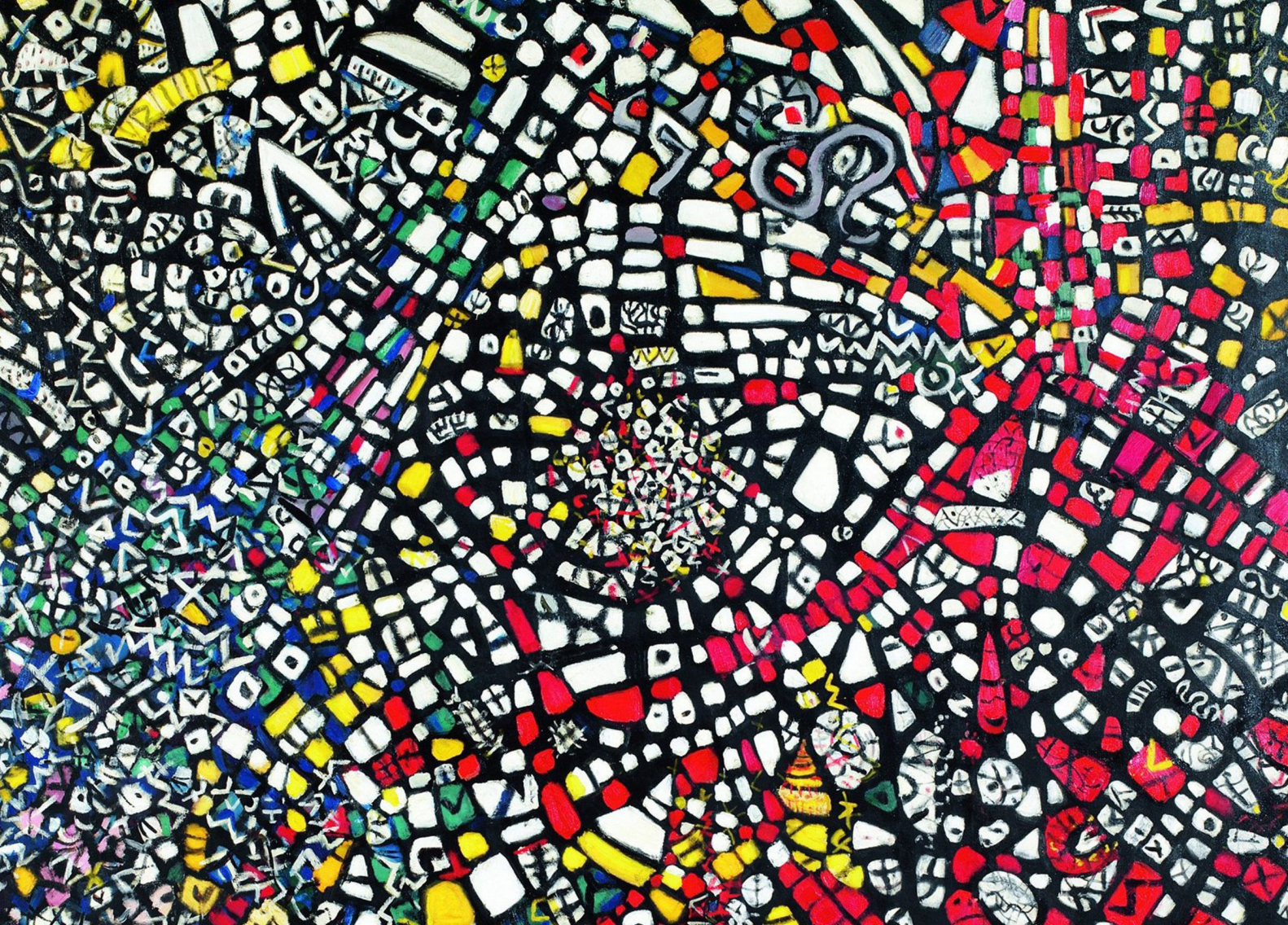
Fahrelnissa Zeid, "Triton Octopus", 1953