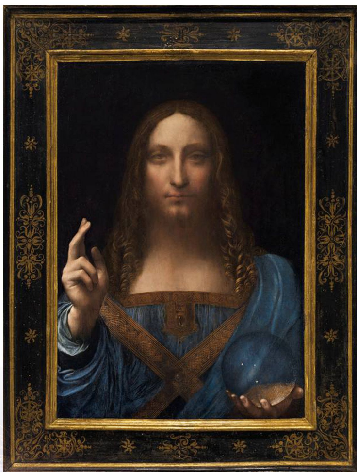
Leonardo Da Vinci, "Salvator Mundi", Oil Painting, Christie's, 450 million dollars.